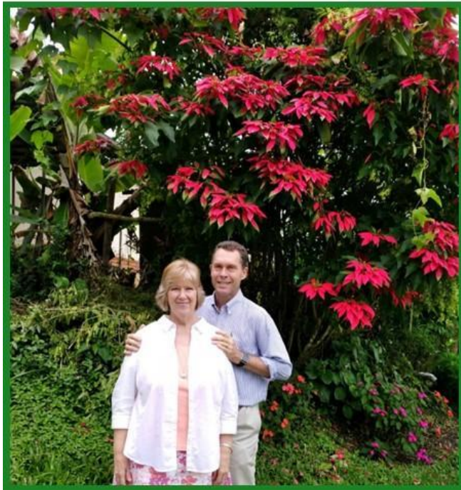
Poinsettias here are taller than we are!